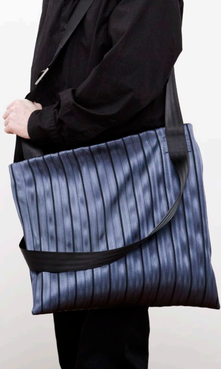
LEO TOTE BAG IN BLACK AND NAVY

KAO PAO SHU MEN'S FALL/WINTER 2014 WWW.KAOPAOSHU.COM INFO@KAOPAOSHU.COM