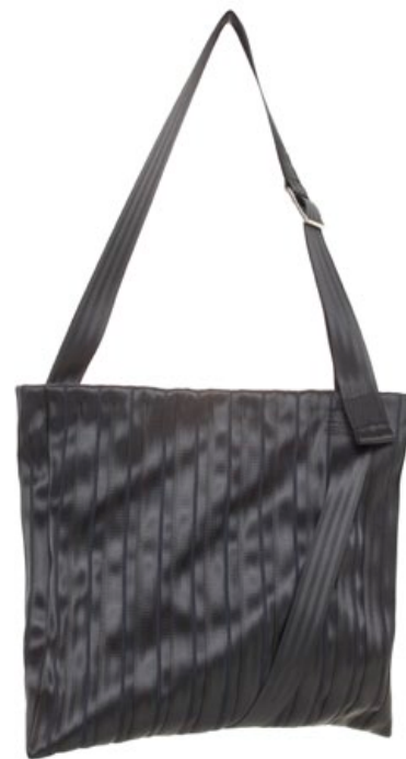
LEO TOTE BAG IN BLACK