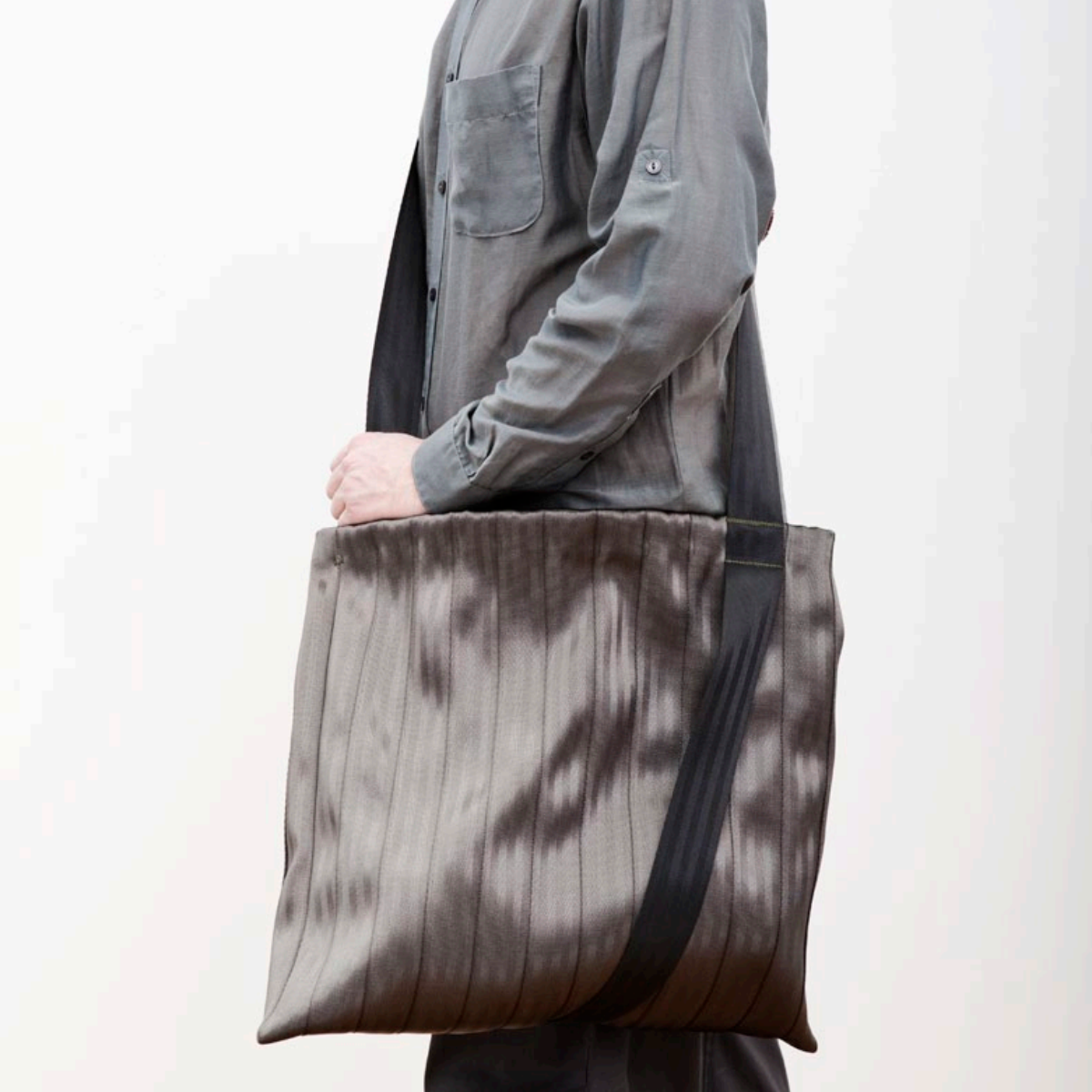
LEO TOTE BAG IN OLIVE