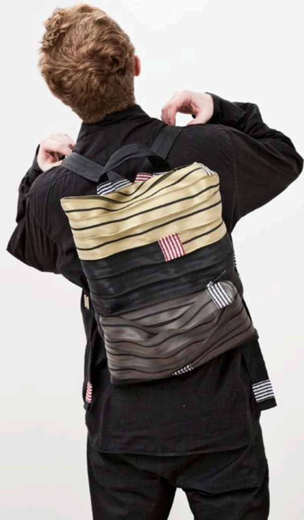
FRED BACKPACK IN MULTICOLOR OLIVE AND GOLD