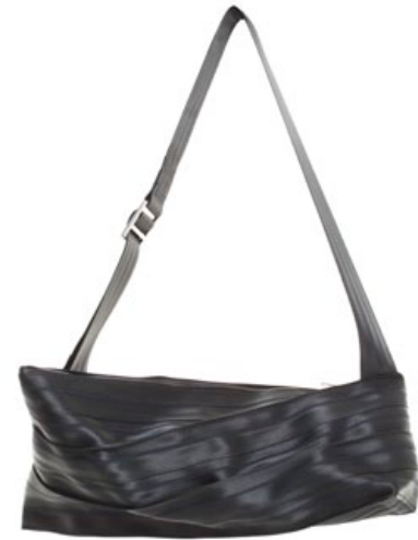
JOE BAG IN BLACK