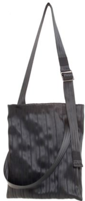
LEO BUCKET BAG IN BLACK