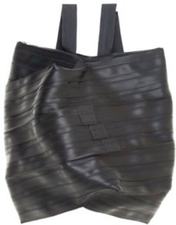
CHARLIE BACKPACK IN BLACK