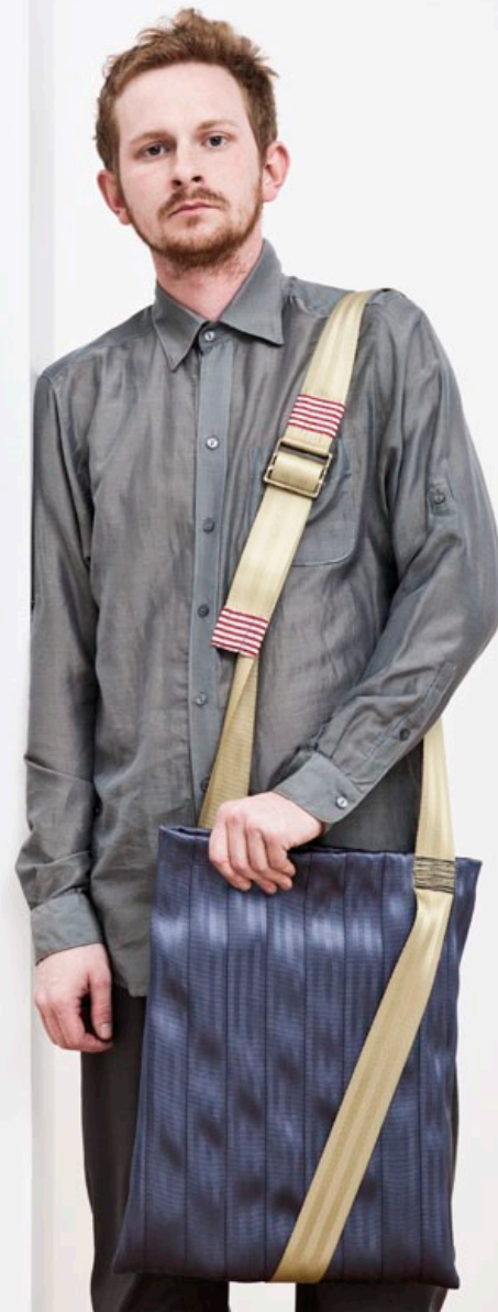
LEO BUCKET BAG IN NAVY AND GOLD