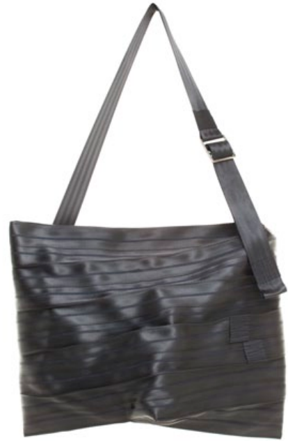
JAMES BAG IN BLACK