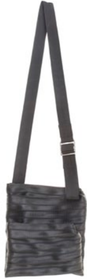
VINCENT BORSELLO IN BLACK